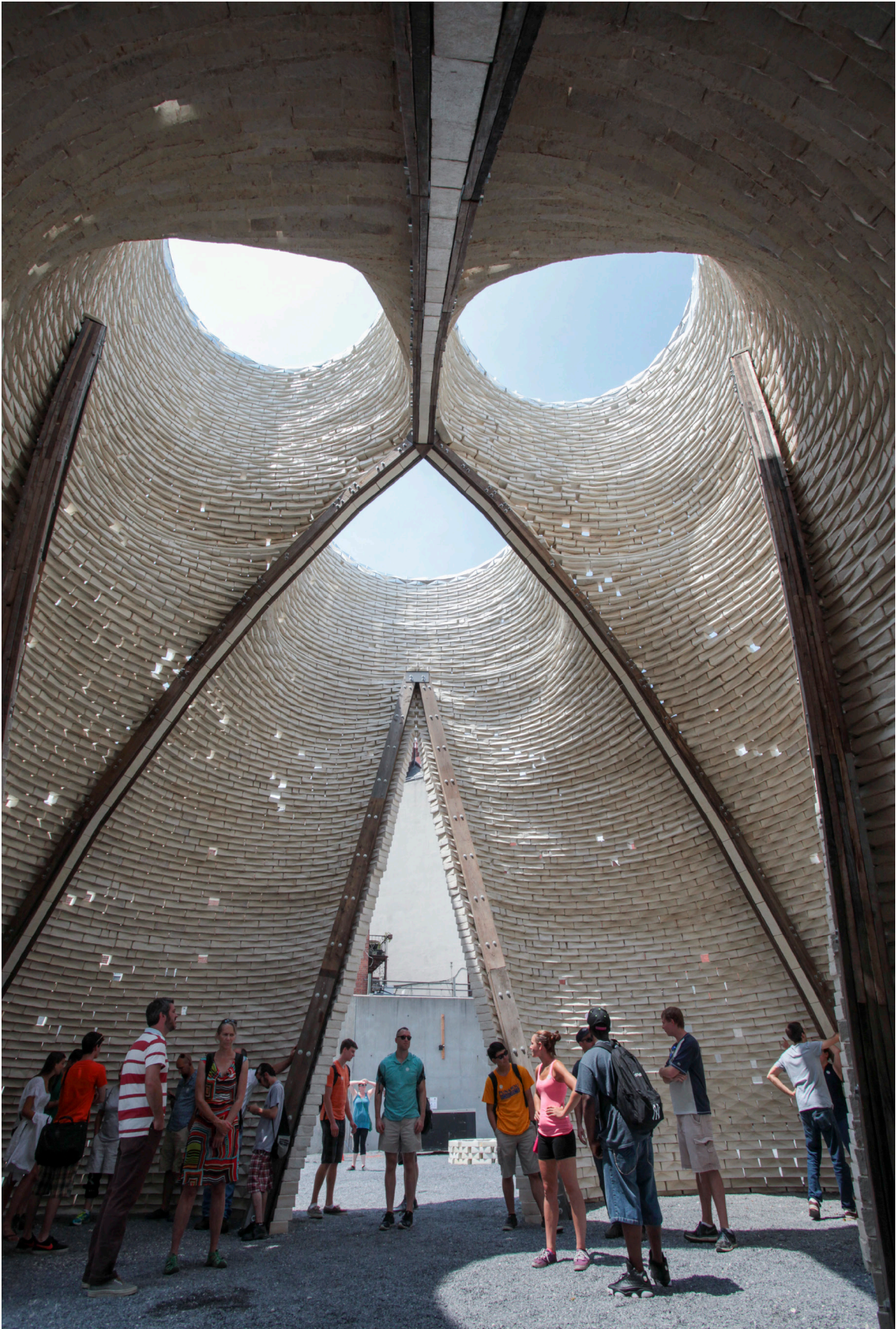
Figure 2: Hy-Fi Tower The building blocks of the Hy-Fi Tower installation at New York's Museum of Modern Art were grown from Ecovative's Mushroom Material.