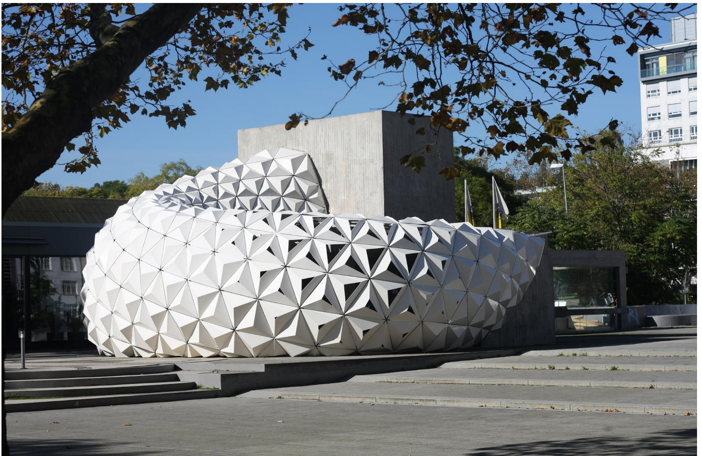
Figure 3: Arboskin Building The ArboSkin pavilion at the University of Stuttgart is made from 388 biodegradable bioplastic panels.