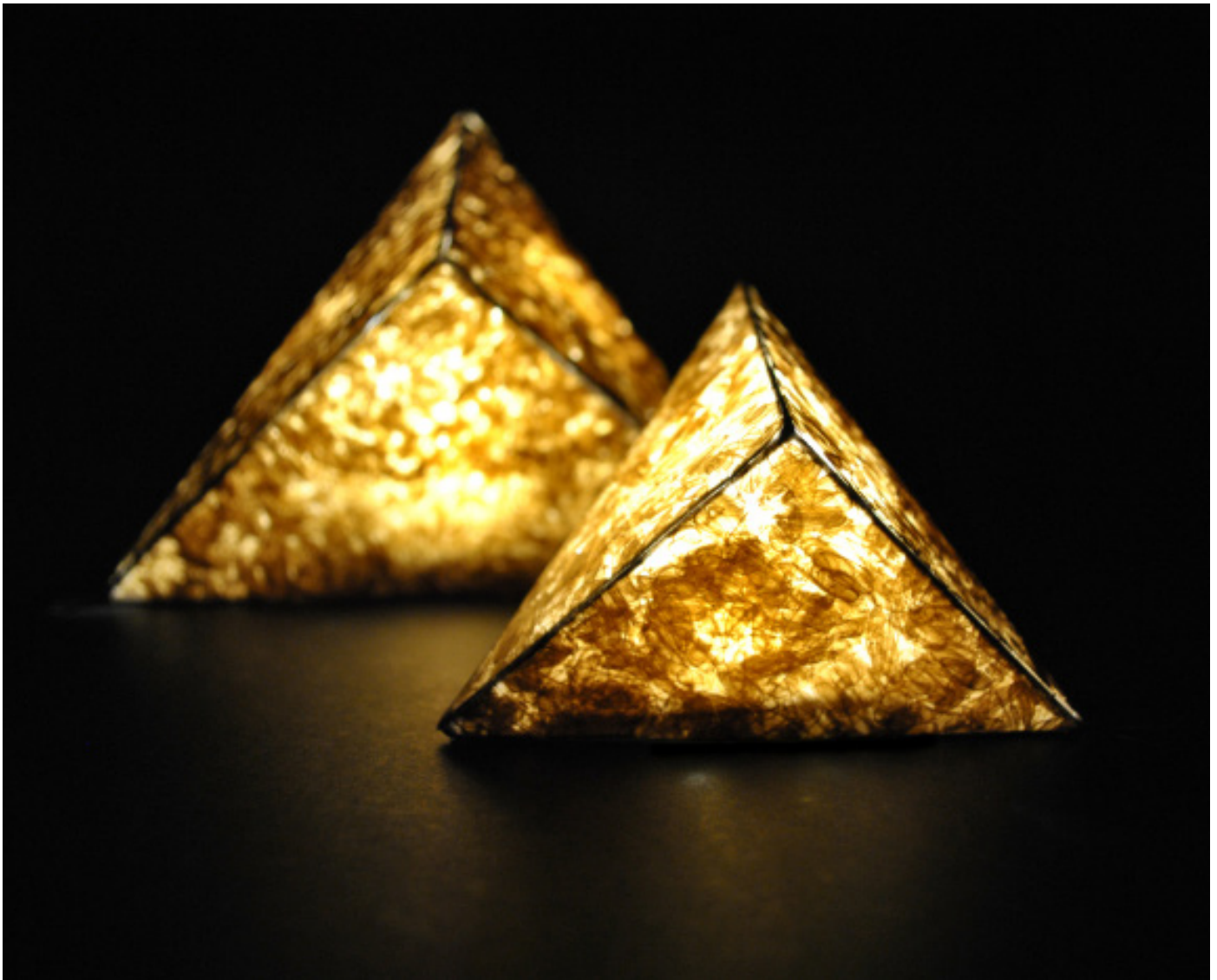
Figure 3: Darkling Beetle Bioplastic Lanterns The shells of dead Darkling Beetles, which are made of the natural polymer, chitin, are the material of choice for lanterns by Dutch designer Aagje Hoekstra.